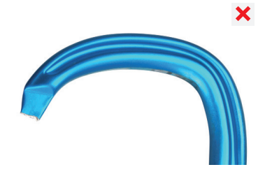
smaller scratches - service