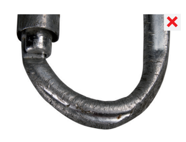
smaller scratches - service