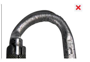
10% wear of material